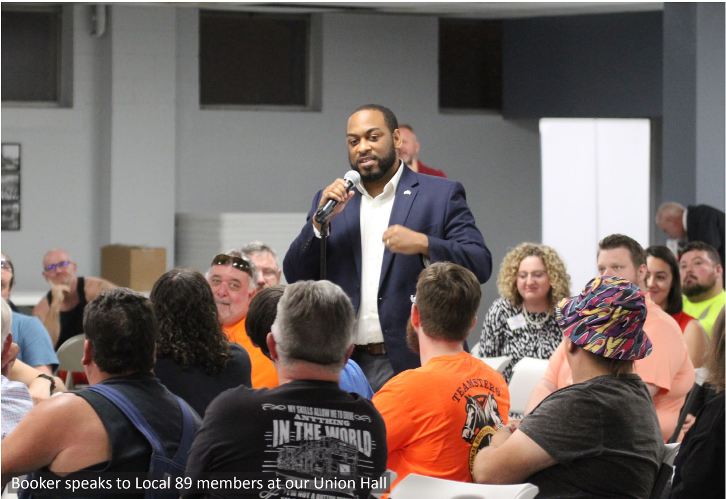
Booker speaks to Local 89 members at our Union Hall

For the labor movement to thrive, we need allies in our nation's capital who are willing to expand our legal rights. When it comes to allies in the United States Senate, we would do no better than Charles Booker.